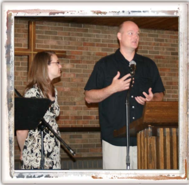
Speaking in the Chicago Area. At the end of August we were invited to share about Wycliffe and our ministry in the Chicago area.