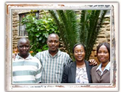
Co-workers. Some of the people with whom we will be working in Kenya.