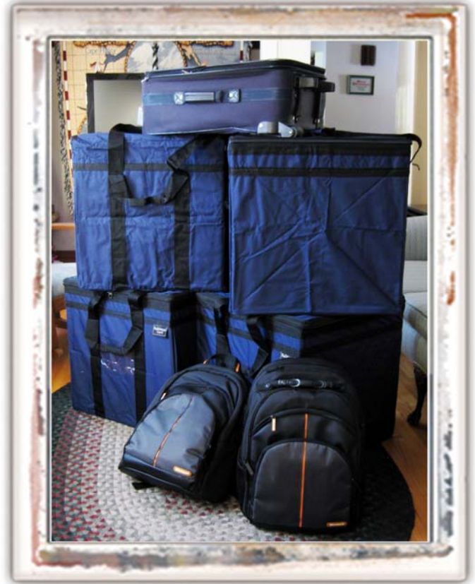
Pile of bags. These are some of the bags we will be taking with us to Kenya.

We're excited and nervous. There's still a lot to do, and our departure is in a week. Thank you for being part of getting us to this point!