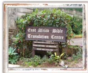
Bible Translation Center. The sign in front of the office where we will be working.