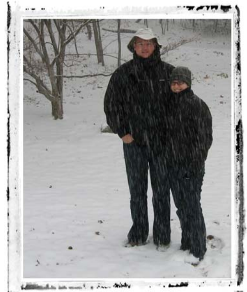
SNOW! We're enjoying a northern winter after many years of living in the south.

Check out our personal blog for regular updates on what's going on with us: http://www.thepubols.com