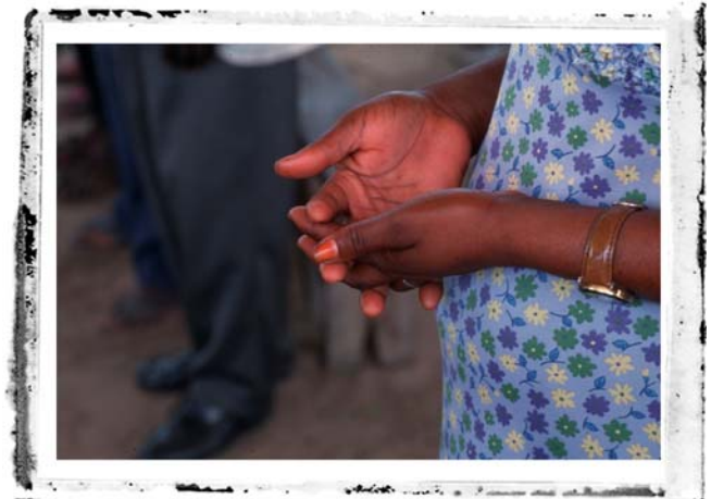
Praying for peace. Christians around the world are joining with Kenyan Christians to pray for peace in Kenya.

You may be wondering how the situation in Kenya will impact our assignments. Our organization is constantly monitoring the safety of its workers, and regularly participates in contingency planning. As of January 7 the office in Nairobi reopened. While the organization is limiting unnecessary travel of its staff to Kenya, the situation did not escalate to